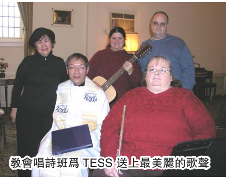
教會唱詩班為 TESS 送上最美麗的歌聲