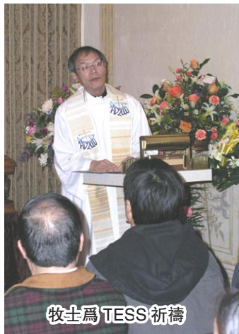
牧士為 TESS 祈禱