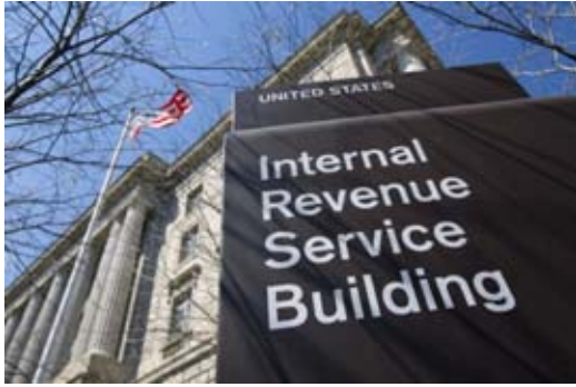
文章來源: 星島日報 國稅局(IRS)宣佈明年將于紐約、加州、佛

州等13個州份試行“直接報稅”(Direct File)計劃,讓合資格的民衆自行免費報稅,當事人必須收入在特定範圍或享受個別抵免政策。國稅局表示,希望借此評估報稅系統、客戶支援、納稅人體驗等因素,確定未來是否擴大計劃。