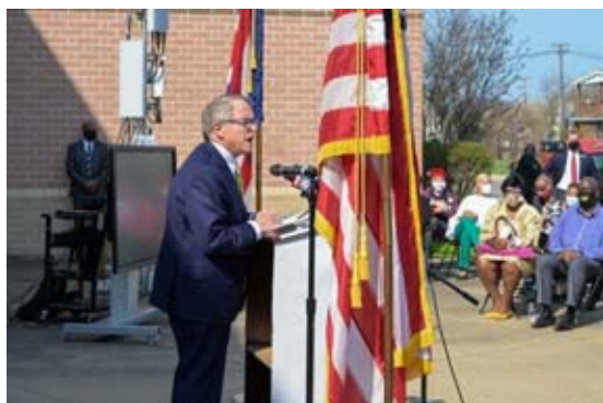
On Wednesday, Governor DeWine and Lt. Governor Husted announced a new broadband expansion project located in the City of East Cleveland. The pilot project will connect residents to reliable, low-cost high-speed internet.

"East Cleveland, like many other urban and rural communities, has lacked both the infrastructure and access to low-cost broadband for many residents. This new project plans to provide both the infrastructure and access for up to 2,000 families," said Governor DeWine. "All of the partners in the public-private partnership have come together to bring access to high-speed internet for families throughout East Cleveland."