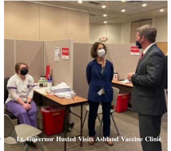
Lt. Governor Husted Visits Ashland Vaccine Clinic

Lt. Governor Husted also announced enhance-