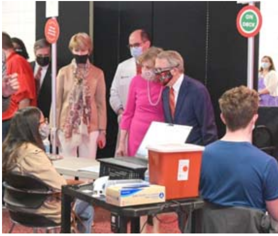
Governor DeWine and First Lady Fran DeWine visit the mass vaccination site at Ohio State University's Schottenstein Center

Throughout the week, Ohio Governor Mike DeWine and Lt. Governor Jon Husted provided updates on Ohio's response to the COVID-19 pandemic, as well as other state initiatives.