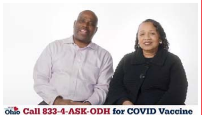
Call 833-4-ASK-ODH for COVID Vaccine

For more information on Ohio's response to COVID-19, visit coronavirus.ohio.gov or call 1-833-4-ASK-ODH.